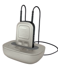
TVLink II 1